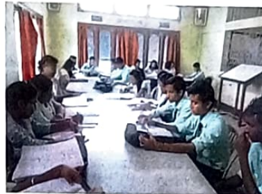
Students' Reading Room